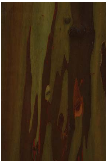
01-Shedding Eucalyptus (Eucalyptus globulus)Tree Bark Reveals Colorful Trunk.jpg