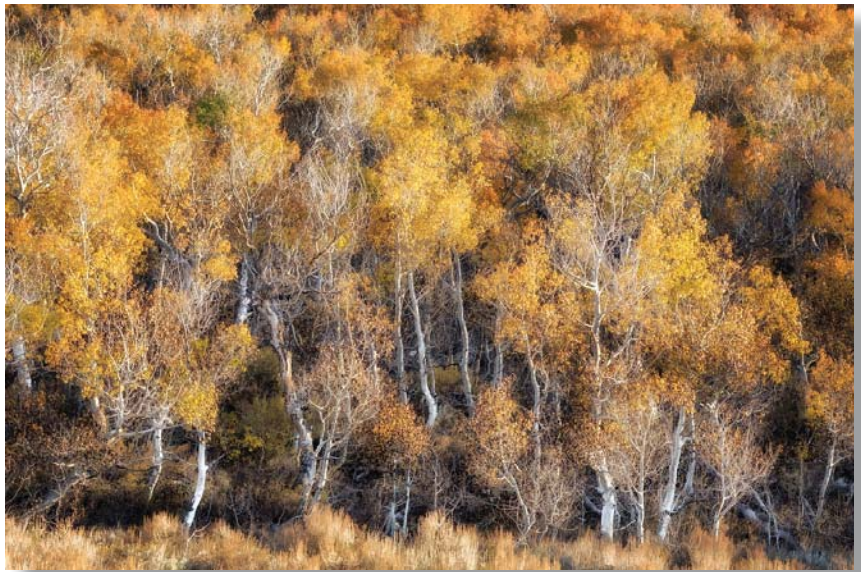
Fall Color Aspen Grove Denice Loria Woyski