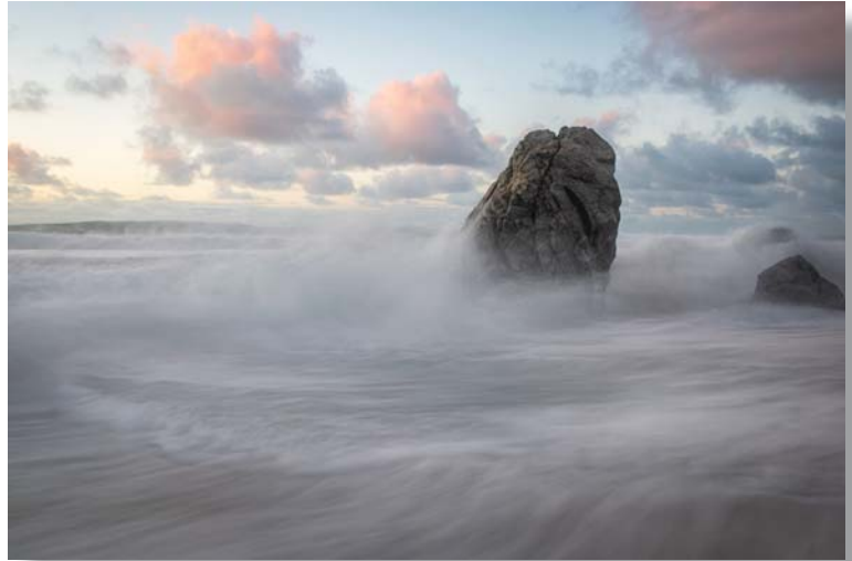
Wave Action on Sea Stack