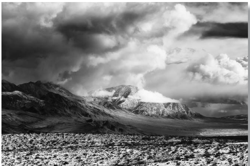
Snow Storm over Death Valley Denice Loria Woyski