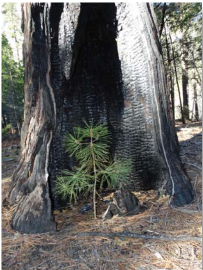
02-PHOENIX Incense cedar and Jeffrey pine (Calocedrus decurrens and Pinus jeffreyi).jpg